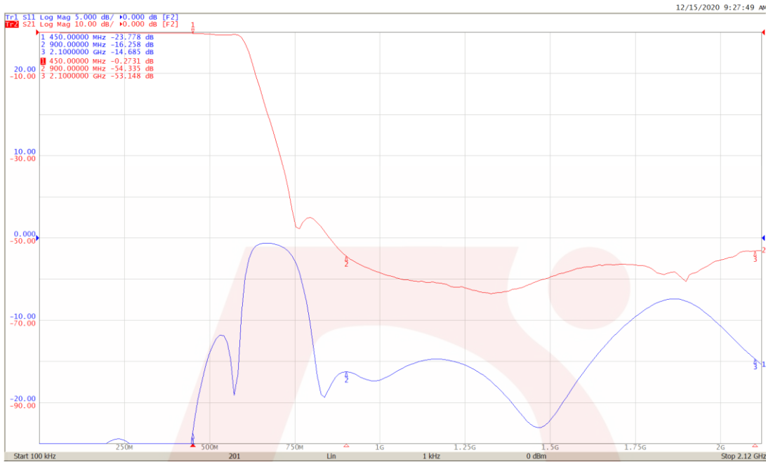
Rx: Return Loss and Insertion Loss and Ripple and Rejection