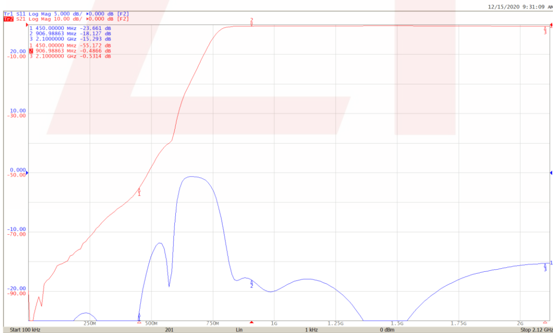
Tx: Return Loss and Insertion Loss and Ripple and Rejection