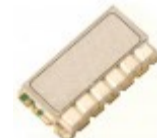
4450 MHz Ceramic Band Pass Filter