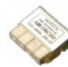
WiFi Cavity Band Pass Filter